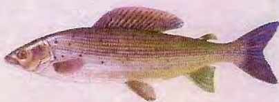
Trout and grayling

Less is more when it comes to your flies, so try and avoid becoming a "tackle tart"